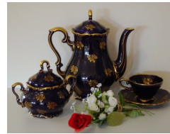
Women Contemporary Artists: New Members Tea Feb 6 th